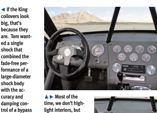
light interiors, but the controls and dash have more featureworthy function than we dare to ignore. The panels are bordered by 'cage tubing, and each is easily removable to access electrical components. Auto Meter gauges let driver and codriver know what's hap-