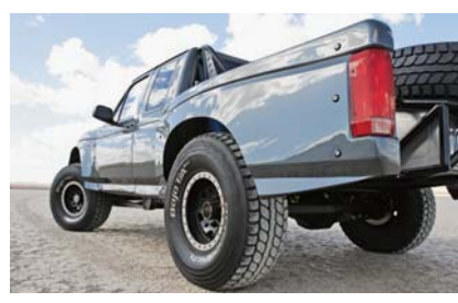
▲ While it wouldn't do justice to this truck not to stare at it for hours, the real fun begins after you climb in, sit down, and hang on as the landscape blasts by outside the window. This truck's wheelbase was originally 139 inches, but SI shortened it to 127 inches for improved handling characteristics. We like the way the bedsides envelop the back of the Super Cab.

"I have the best of both worlds," he says. "Running a fab shop full-time is stressful, and being a cop full-time is stressful, so it's good to be able to change up every few days." Stu's patience and resources combined