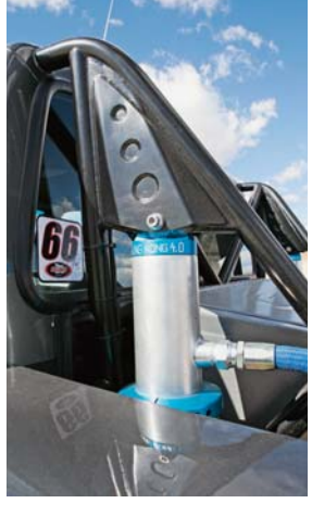
a top priority and a byproduct of using only one shock per corner. Since he'd worked extensively with King in the past, Tom approached the King family about producing the shock of his dreams to go on the truck of his dreams. The result is a patent-pending, true 4-inch piston, internalbypass über-shock. At the deepest reaches of compression travel, the shocks have a built-in bumpstop zone to control the harshest slams the desert can deliver. Up front, the big guns are supplemented by a pair of King hydraulic bumpstops, while a pair of rubber pucks insulates the rear frame from the axlehousing at full compression. After running the big F-150 at 75-plus through deep whoops in Lucerne Valley, we were stoked to find we could touch the shock bodies with our bare hands without scorching our skin the large diameter and attendant volume of oil does a great job of dissipating the heat.