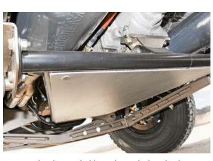
▲ As previously stated, this truck was designed to be easy to work on. If the Ken Mogi-built C6 needs to be dropped for maintenance, the entire framework and skidplate beneath it can easily be unbolted for access. A pair of MagnaFlow mufflers quiets down things while preserving the throaty note produced by the 650 ponies under the hood. The mufflers bolt to custom SI headers.