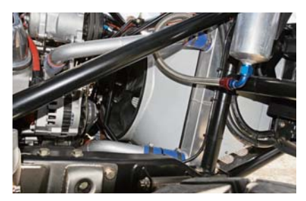
▲ Big ponies put out big heat, so a Ron Davis aluminum radiator sits up front to supply the chill. Tom's TIG-welding expertise also includes aluminum: He built the radiator shroud and sectioned the aluminum radiator tubing.

comfortable. It's easy to work on when necessary. Last but not least, it's got a nice set of doors. From unsafe heap to a genuine masterpiece, Stu Ackley's F-150 dreams have come full circle. OR